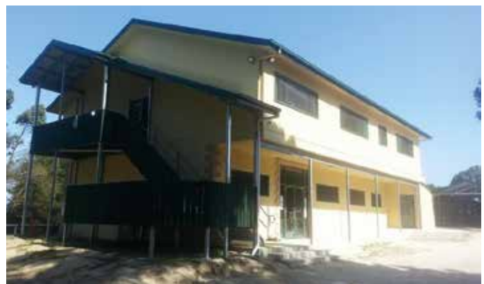
Plane Tree Lodge

Please bring your own bedding and towels (doona/sleeping bag and pillow). Alternatively, bedding is available for a supplement of $10+GST. If you'd like to hire it from us, please discuss this with our Reservations Team before travel.