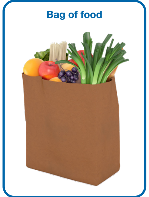
Bag of food